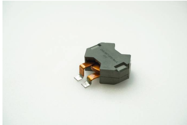
SMD high current power inductor