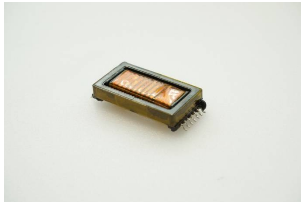
SMD Transformer (Inverter)