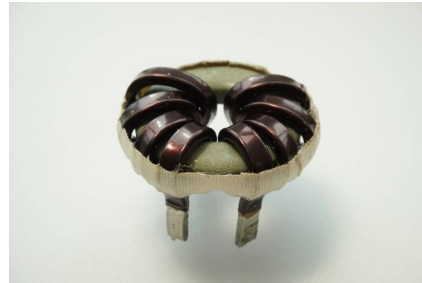
Single phase common mode choke