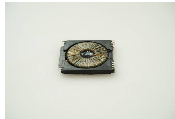
Driver transformer (sensing)