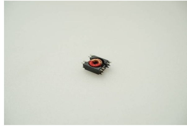
Miniature inductor with SMD base